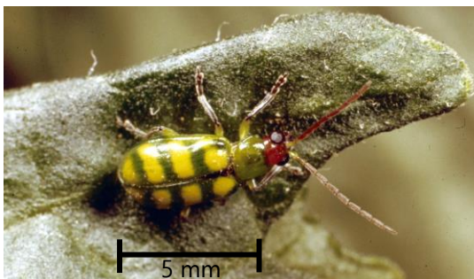
Fig 1. Adult Banded cucumber beetle.

Banded cucumber beetles are present in North, Central and South America.