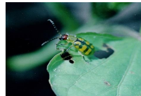
Fig 2. Adult Banded cucumber beetle,

Check your production sites frequently for the presence of new diseases and unusual symptoms. Make sure you are familiar with common pests and diseases of your industry so you can recognise something different.