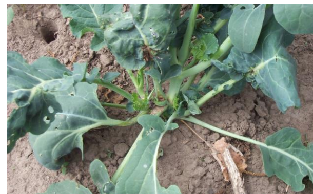
Fig 3. Damaged cabbage plant with brown scarring, multiple stems and twisted leaves.