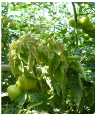
Fig 2. TASVd symptoms on tomato.