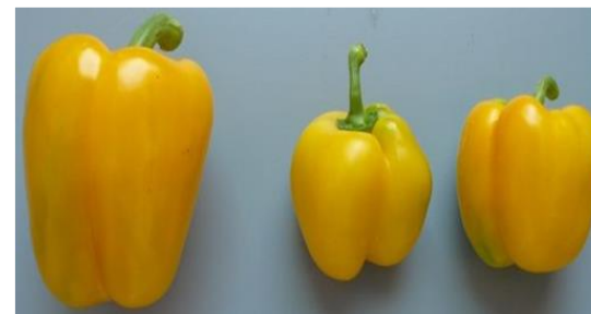
Fig 3. A non-infected (left) and two small PCFVd-infected fruits (right).

Check your production sites frequently for the presence of new diseases and unusual symptoms. Make sure you are familiar with common pests and diseases of your industry so you can recognise something different.