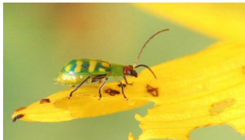
Fig 1. Adult Banded cucumber beetle.

Banded cucumber beetles are present in North, Central and South America.