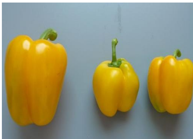
Fig 1. A non-infected fruit of capsicum pepper cv. Lamborgini (left) and two small fruits infected by PCFVd (right).

There are a variety of ways by which viroids are transmitted. For example, TASVd has been shown to be transmitted mechanically and via seed. It has also been confirmed that bumblebees can transmit TASVd from infected plants to healthy plants during pollination. TPMVd has not been shown to be transmitted by seed but is transmitted mechanically and by aphids. It is also thought that viroids are present in wild plants or ornamentals (but do not show symptoms) and may transfer to crops.