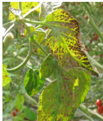
Fig 1. CLVd symptoms on tomato.

PSTVd has been detected in New Zealand but has been eradicated.