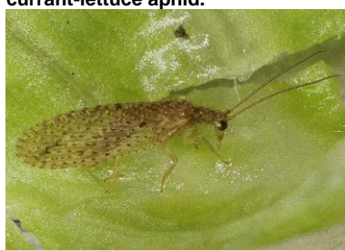
A Tasmanian brown lacewing adult ( Micromus tasmaniae ) with its distinctive lace-like wings.