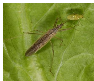
An adult damsel bug ( Nabis kinbergii ) attacking an aphid.