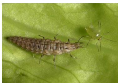
A Tasmanian brown lacewing larva ( Micromus tasmaniae ) attacking a currant-lettuce aphid.