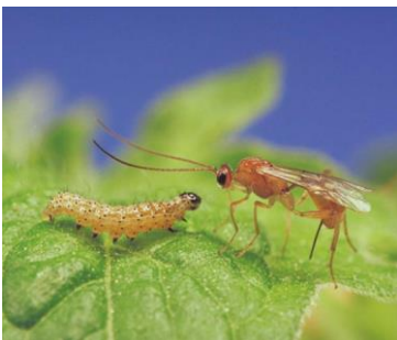
Meteorus pulchricornis adult parasitoid ready to parasitise a Heliothis caterpillar.