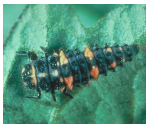
An eleven-spotted ladybird ( Coccinella undecimpunctata ) larva.