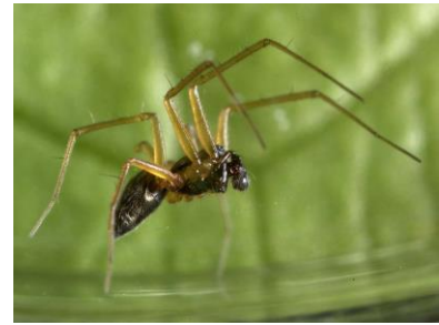
Sheetweb spiders are frequently found in vegetable crops.