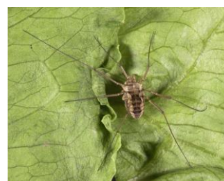
Harvestman spiders may attack small caterpillars in lettuce.