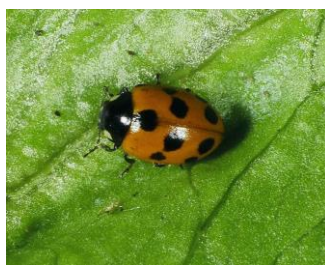
The eleven-spotted ladybird ( Coccinella undecimpunctata ) is known to attack aphids.