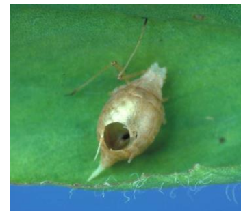
An empty aphid mummy, parasitised by an Aphidius parasitoid.