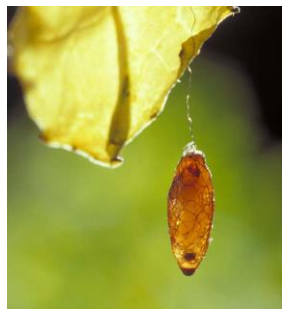
A Meteorus pulchricornis cocoon hanging from a lettuce leaf.