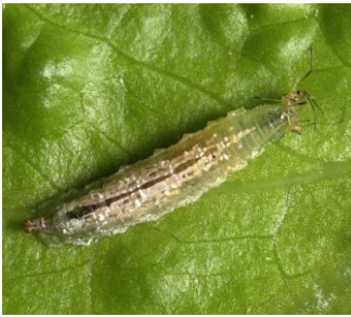
A hover fly larva ( Melanostoma fasciatum ) feeding on a currant-lettuce aphid.