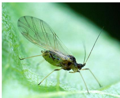
Myzus persicae (GPA) winged adult