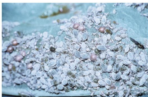
Brevicoryne brassicae (Cabbage grey aphid winged adult)