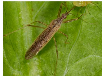
Damsel bug adult