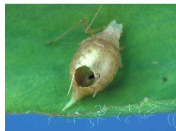
An Aphidius parasitoid aphid mummy