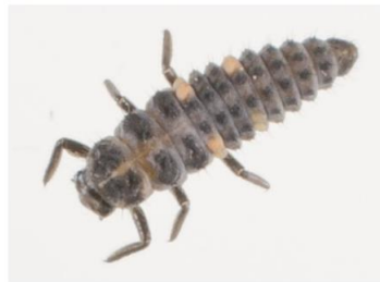
11-spotted ladybird larva