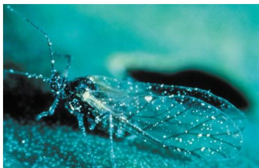
Myzus persicae (Green peach aphid) (GPA) nymphs

Green peach aphid ( Myzus persicae ) (GPA); Cabbage grey aphid ( Brevicoryne brassicae )