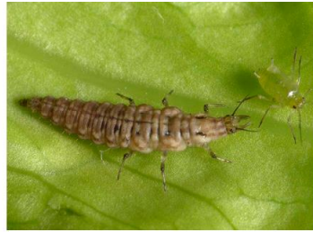
Tasmanian brown lacewing larva