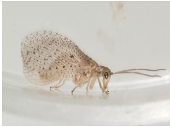
Tasmanian brown lacewing adult