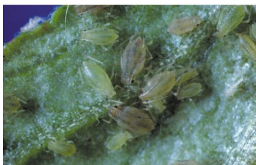
Brevicoryne brassicae (Cabbage grey aphid) nymphs