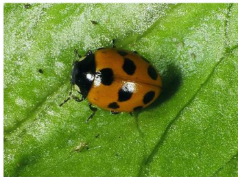
11-spotted ladybird adult